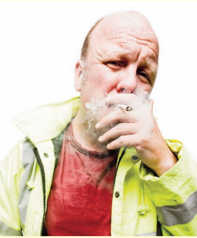
Smoking prevalence is highest among people with manual occupations

There are several different types of NRT and the right one depends on a number of different factors, including how dependent the person is on their habit. Combining two forms of NRT can sometimes provide greater flexibility, particularly for those who experience