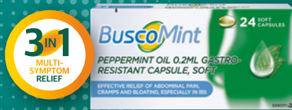
Peppermint oil 0.2ml

Buscomint Peppermint Oil 0.2ml gastro-resistant capsule, soft (GSL)